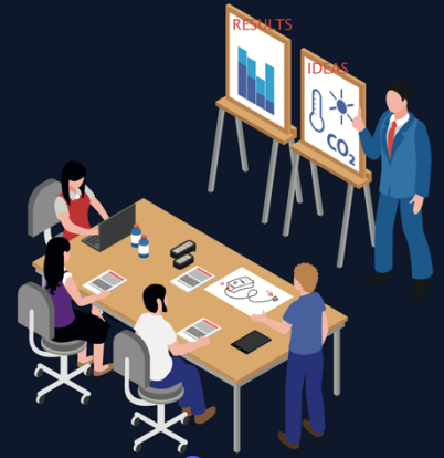
Evaluation of pilot results & solution optimisation